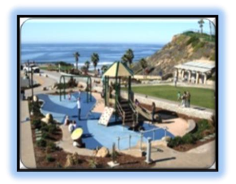
Parks & Recreation

Position's Requirements: At least 18 yrs. old * Resident of the City.